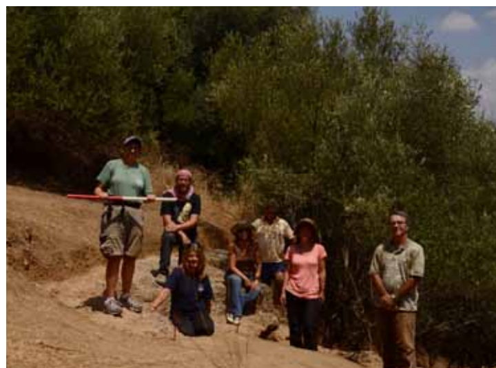
The team on site

The fieldwork conducted in 2011, and its full publication, will lead to a far better understanding of the processes involved in the construction of Mycenaean prestige architecture. The team is presenting the results of their research at the Archaeological Institute of America annual meeting in January.