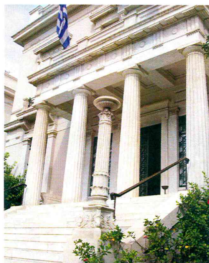
The portico of the Benaki Museum in Athens

The eventual catalogue will be a co-publication between the Institute and the Benaki.