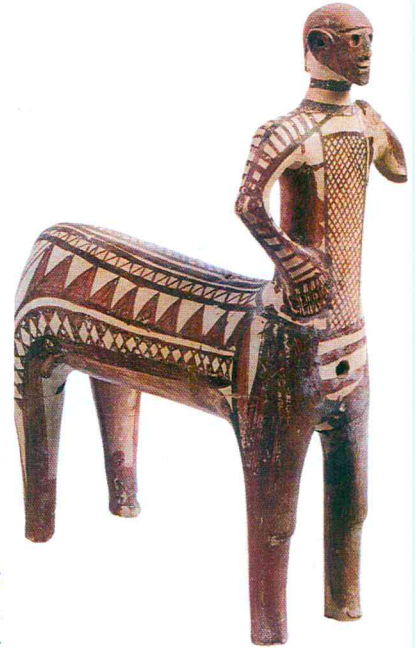
Image: Terracotta Figurine of a Centaur. Lefkandi. Late Protogeometric Period, Archaeological Museum, Eretria (8620)