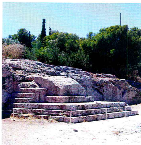
The Pnyx with the carved steps of the speaker's platform

One of the pleasures of holding the position of Deputy Director in Athens is that I have the opportunity to introduce groups of visiting supporters to the city's many layers of history. One such occasion was the recent educational tour that brought a group of students and two of their from Randwick Boys' High School to Greece. I was very happy to spend a morning with them walking the parkland ridge to the west of the Acropolis that runs from Philopappos Hill to the Pnyx (the meeting site of the ancient democratic Assembly). This is an ideal vantage point to take in so much of Athens' ancient, mediaeval and modern history, and to underline the importance of the port of the Peiraieus to the city's classical-period strength. I believe we had a very rewarding morning underscored by the enthusiasm of the students themselves.