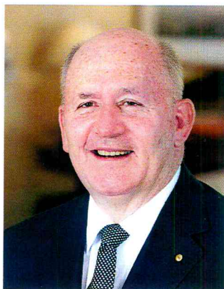
The Institute's new Patron in Chief

It is with very great pleasure that the Institute announces that it has a new Patron in Chief. His Excellency General The Honourable Sir Peter Cosgrove AK, MC, Governor General of the Commonwealth of Australia has generously agreed to accept the role of Patron in Chief of the AAIA. The Institute is deeply grateful to His Excellency and feels great pride in having received strong vice-regal support since its establishment in 1980.