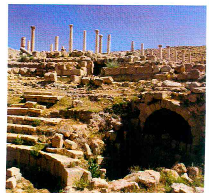
Pella in Jordan

Expressions of Interest are sought. Email arts.aaia@sydney.edu.au