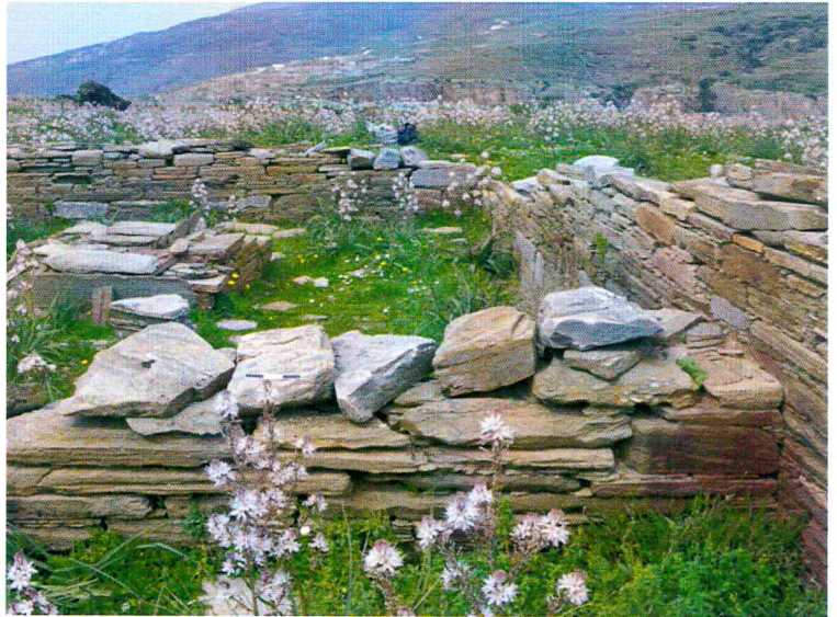
Detail of the Temple at Zagora: Example of conservation capping of a wall, undertaken in 1974

Zagora, while remote, remains open to the public. Early Iron Age (EIA) architectural remains project above the surface and could easily be damaged by visitors and local wildlife. The first Australian team at Zagora in the 60s and 70s took an innovative approach to conservation for that time and packed the EIA walls on either side and on top (in Greek Εγκλωβισμός) with local schist to protect them from the elements, visitors and wildlife. The new team hopes to use 21st century techniques that will ensure that the originally conserved portion of the site is stabilised and any newly excavated architectural remains protected. The proposed programme of conservation works has been designed by Dr Stephania Chlouveraki who was instrumental in designing the conservation plan at the site of Azoria on Crete. The Directors of this project were awarded the American Institute of Archaeology's "Best Practices in Site Preservation Award for 2012."