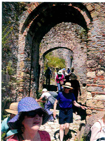
The Athens Friends at Mystras

expertise. The first stop on the itinerary was Sparta, where we visited the small but impressive Archaeological Museum, the Acropolis of ancient Sparta, and the well-presented displays at the Museum of the Olive and Greek Olive Oil. Next stop on the itinerary was the imposing medieval ghost-town of Mystras, with its many churches and palace, set on a magnificent mountainside overlooking the lush plain of Sparta. The highlight of the trip was our visit to Monemvasia, an important Byzantine maritime settlement on a fortified, steep rock that dramatically protrudes out of the sea, connected to the mainland by a narrow land bridge. Finally, on our last day we walked up a steep ascent, on the slopes of Mt. Parnon, to the Menelaion (the site of a Mycenaean palace and a significant Archaic-Classical sanctuary dedicated to Menelaus and Helen), just outside of Sparta. Those of us who made it all the way to the top of the hill were rewarded by the amazing views of the ever-imposing Taygetos mountains and the vast Lakonian plain! Many thanks to the organizers of the trip, especially Elizabeth Gandley, and to everyone who participated and made it a very pleasant event!