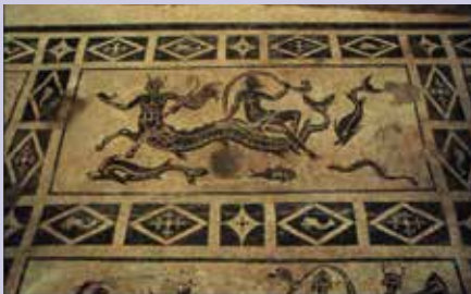
Detail of the monochrome floor mosaic in the Roman bath complex, Isthmia, depicting Tritons with Nereids on their backs, surrounded by various sea creatures

Any international organisations which want more information about “International Institutional Membership” should contact arts.aaia@sydney.edu.au