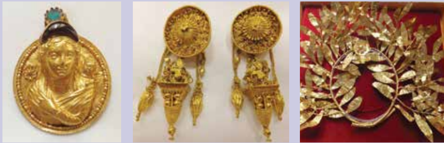
From left: Medallion with Aphrodite and Eros, late 3rd cent. BC; disc and pyramid earrings showing a Muse reclining in foliage, playing the lyre, 4th cent BC; myrtle wreath, late 4th cent BC (on display in the Hellenic Museum, Melbourne)

In September 2014 Melbourne’s Hellenic Museum—founded in 2008 by the Stamoulis family—became the first mini-outpost of the Benaki, Greece’s oldest and largest private museum, with the exhibition “Gods, Myths and Mortals”. It is a stunning snapshot of Hellenic civilisation spanning 8000 years of Greek history. Included is a gold myrtle wreath associated with Aphrodite, Persephone and Demeter. The naturalistic leaves and tiny blossoms were cut from thin sheets of gold, exquisitely finished with stamped and incised details, and then wired on to the stems.