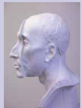
Warrior A, Warrior B. 2014 4 min 44 sec single channel projection. Video still.

Originally commissioned by the Australian Centre for Contemporary Art. Access to the Riace Bronzes granted courtesy Ministero per i Beni e le Attività Culturali, Soprintendenza per i Beni Archeologici della Calabria.