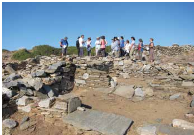
Introductory tour of the site for new 2014 project participants

To keep up to date with the progress of the Zagora excavations visit: www.powerhousemuseum.com/zagora/category/zagora-dig-blog/